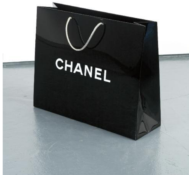
Backless Blackness , 2008 peinture laquée sur bronze automotive enamel on bronze 29" x 36" x 11½" edition: 5