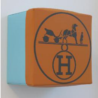
Paying for Compliments , 2005 acrylique, pâte à modeler et vernis sur toile acrylic, modeling paste and varnish on canvas 8¼" x 8¼" x 6" unique