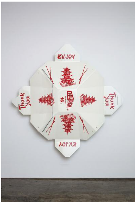
Mandarin Taste , 2010 peinture laquée sur aluminium automotive enamel on aluminium 56" x 56" x 14" edition: 3