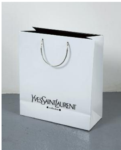
Parting Glance , 2008 peinture laquée sur bronze automotive enamel on bronze 18" x 18" x 7" edition: 10