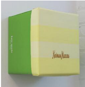
In the Clutch , 2005 acrylique, pâte à modeler et vernis sur toile acrylic, modeling paste and varnish on canvas 8" x 8¼" x 9" unique