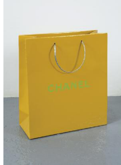
Untitled (Chanel) , 2009 peinture laquée sur bronze automotive enamel on bronze 19" x 17" x 7" edition: 7 (chacune dans une couleur différente / each one in a different colour)