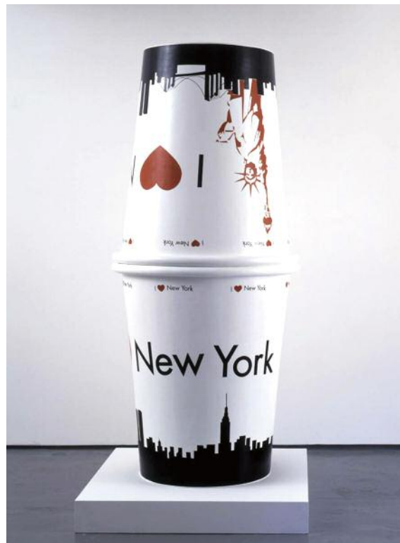
Between Cups , 2006 acrylique et pâte à modeler sur toile acrylic and modeling paste on canvas 72" x 32 \frac{3}{4} " x 32 \frac{3}{4} " unique