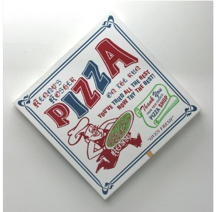
Prosciutto – Arugula , 2007 huile, alkyde, acrylique et pâte à modeler sur toile oil, alkyd, acrylic and modeling paste on canvas 36¾" x 36¾" x 3½" unique