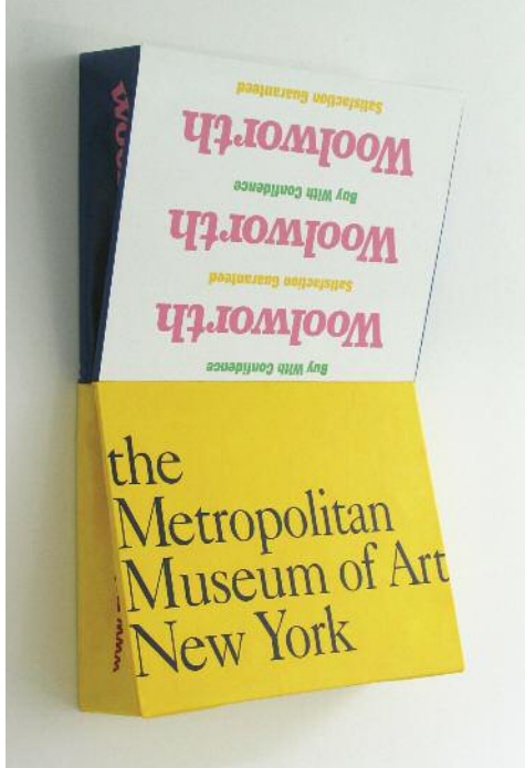
Building Blocks & Pick-up Sticks , 2005 huile, alkyde, acrylique, pâte à modeler et vernis sur toile oil, alkyd, acrylic, modeling paste and varnish on canvas 36" x 22" x 7" unique