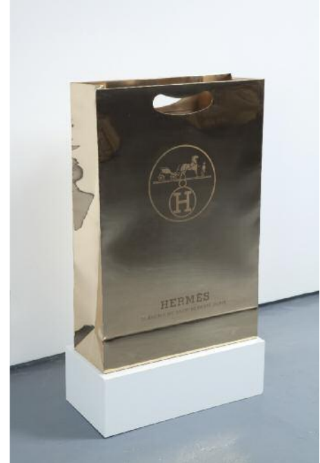
Golden Carriage , 2010 bronze émaillé enamel on bronze 36" x 24" x 9" edition: 5