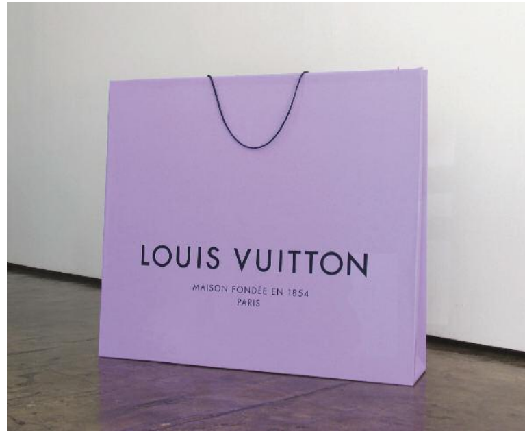
Ebay Collectible , 2005 acrylique, pâte à modeler et vernis sur toile acrylic, modeling paste and varnish on canvas 42" x 48" x 10" unique