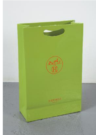
Untitled (Hermes) , 2009 peinture laquée sur bronze automotive enamel on bronze 19" x 17" x 7" edition: 7 (chacune dans une couleur différente / each one in a different colour)